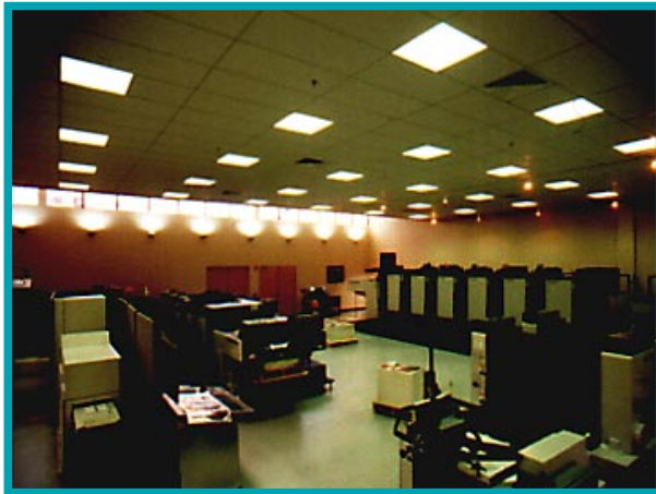
CPI Graphic's new machinery and print finishing showroom