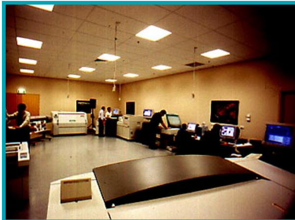
State of the art imaging technology on display in CPI Graphic's new showroom

PRINTED ON MEDIAPRINT SILK T025M ON A KOMORI PRINTING PRESS USING HOSTMANN-STEINBERG RAPIDA INTENSIVE 7080 SERIES INK