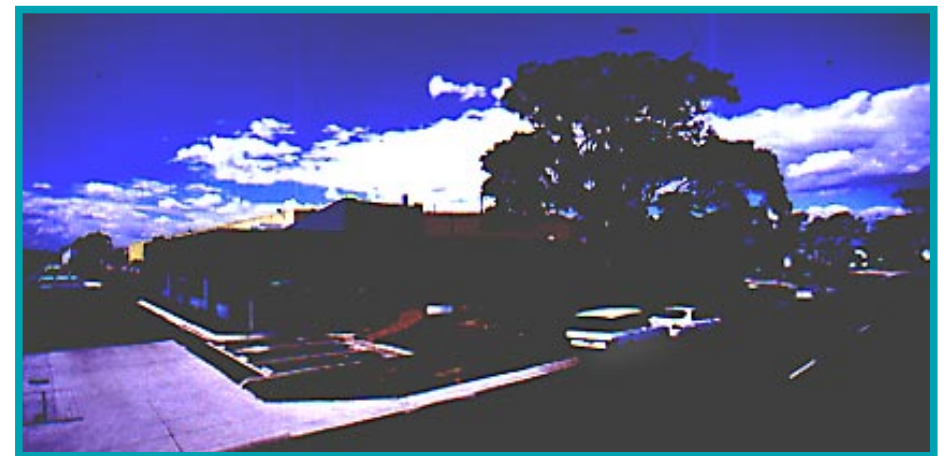
Recently completed Braeside distribution centre

> A total review of our position is under way and we do expect, with a slight change of marketing direction and stronger presence, to make good growth