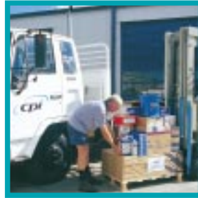
Efficient product delivery and distribution is the result of integration.

The new facilities at Braeside will give customers a feel for the whole CPI business by showcasing new machinery, technology and group products all in one area.